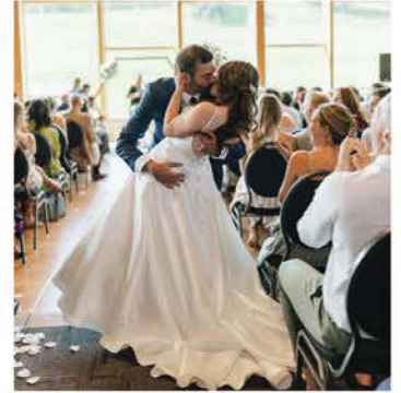
A Sister Collective