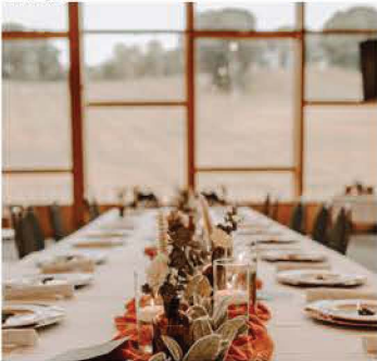
Aurora Pines Photography