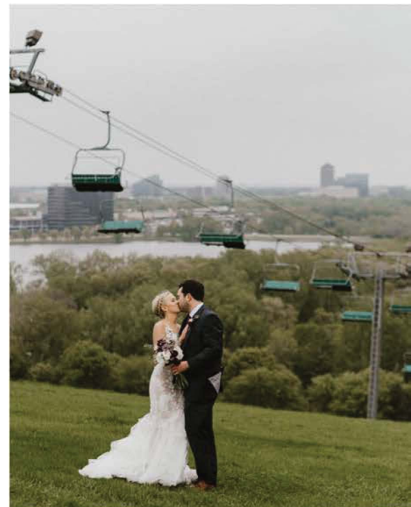
Emily Fritzl Photography