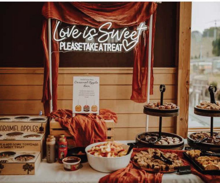
Aurora Pines Photography