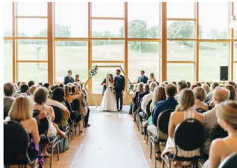
A Sister Collective