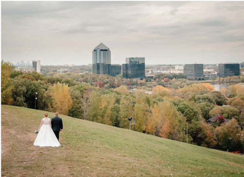
Silver Linings Photography