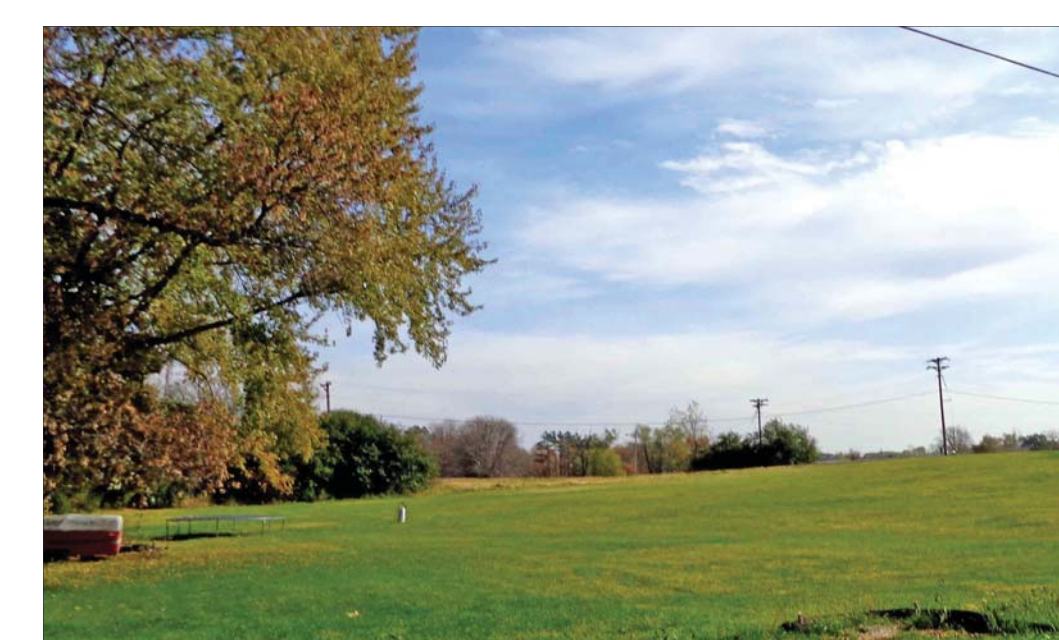
Future redevelopment area