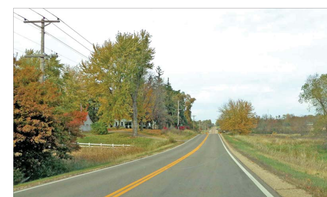
Highway 19, south of Watertown Rd (Hwy 6)