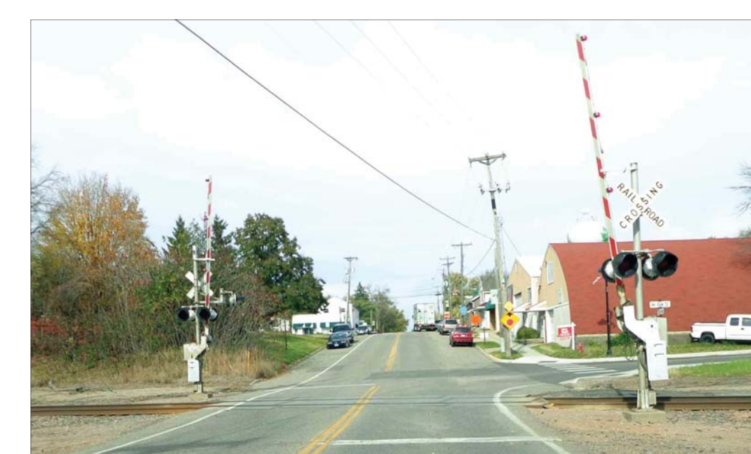
Highway 19 , access to Maple Plain