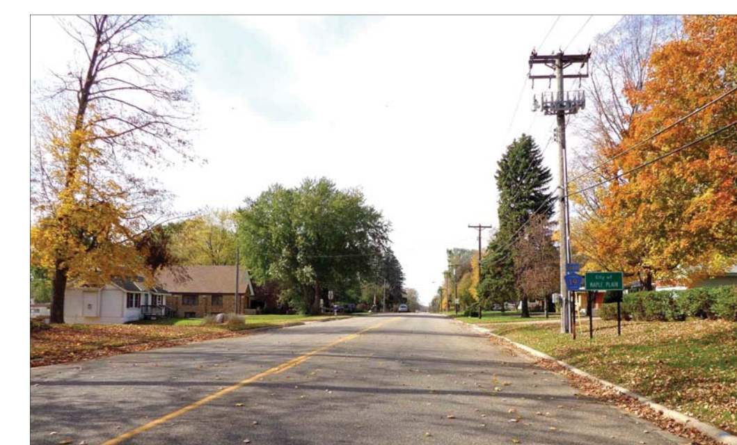
Main Street ( Highway 19)